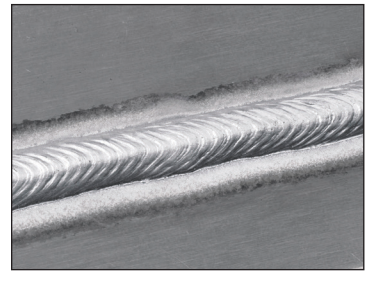
Pulse-On-Pulse on 3 mm Aluminum